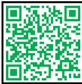
Sexual Misconduct Reporting Form

To file a report or complaint of sexual misconduct, contact the Title IX Coordinator , whose contact information is listed above, or use this QR code to complete an online reporting form: