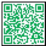
Sexual Misconduct Reporting Form

To file a report or complaint of sexual misconduct, contact the Title IX Coordinator, whose contact information is listed above, or use this QR code to complete an online reporting form: