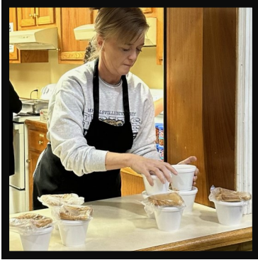
Helping Hands At Work